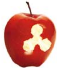
Ascolot. Know more School of Interdisciplinary Studies