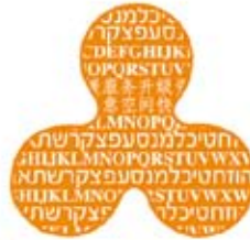
DiAlog. Understand more School of Languages