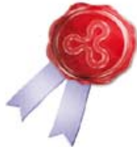
Diploma. More professional Certificate Studies