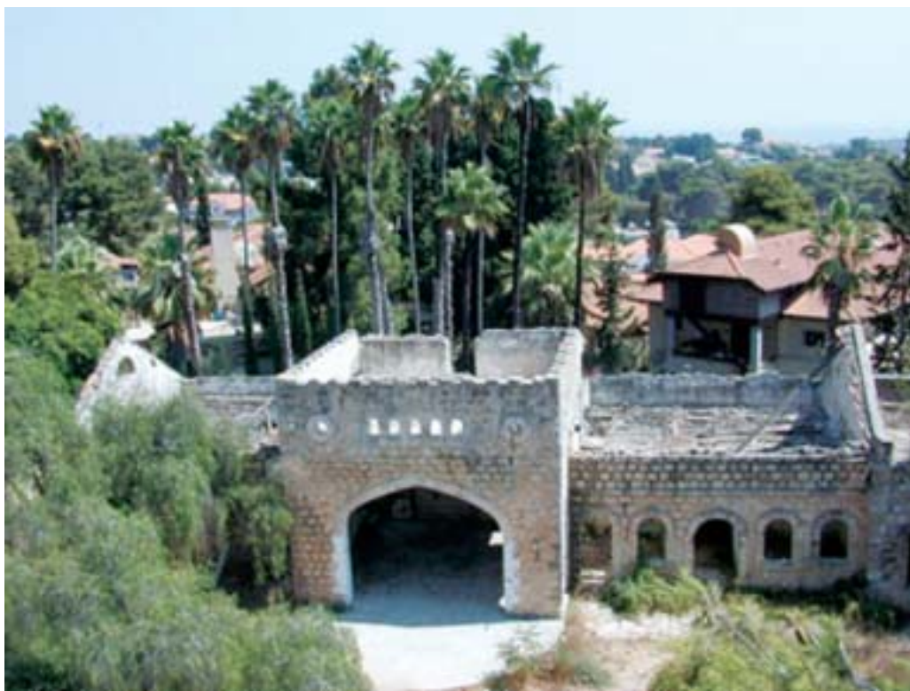
The Carriage House on the Beit Daniel estate

The estate garden that was made operational this year has already been used for the EFI awards ceremony of the Association of Advertisers, as well as for public song evenings and company meetings.