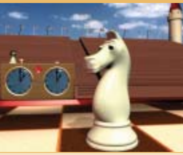
"Voices of Soldiers"