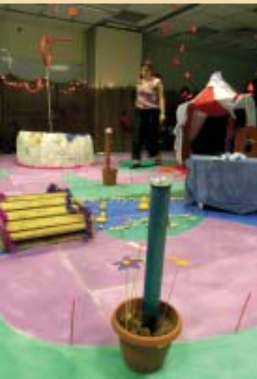
"Chu Chu and I"