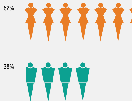
Recipients of bachelor's degrees, 1995-2014