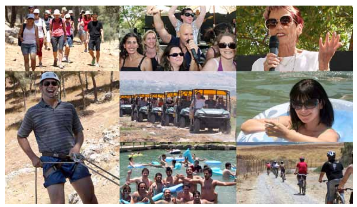
Faculty and administration retreat 2012