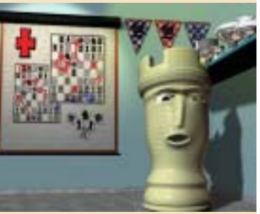
"Voices of Soldiers"