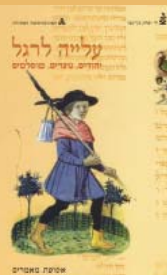
אטיפת פאטרים אייבים אית ליביד אוליבן יייבי

Zmanim, the respected historical quarterly, is a joint publication of the Open University, Tel Aviv University, the Zalman Shazar Center, and the Israel Historical Society. Three of the four issues this year were devoted to collections of articles that focused on specific topics: Psychoanalysis, Judaism, Zionism; The early Middle Ages; and Prostitution in the Ancient World. These unique collections included articles written especially for Zmanim by renowned experts in these fields.